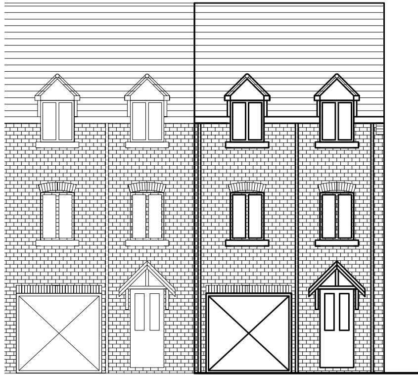
FRONT ELEVATION AS EXISTING (1:100)