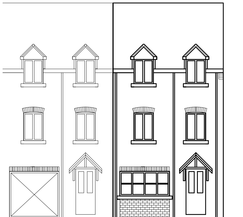
FRONT ELEVATION AS PROPOSED (1:100)