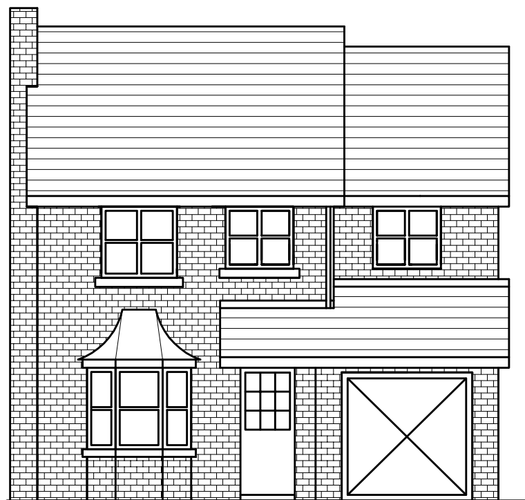
FRONT ELEVATION AS EXISTING (1:100)