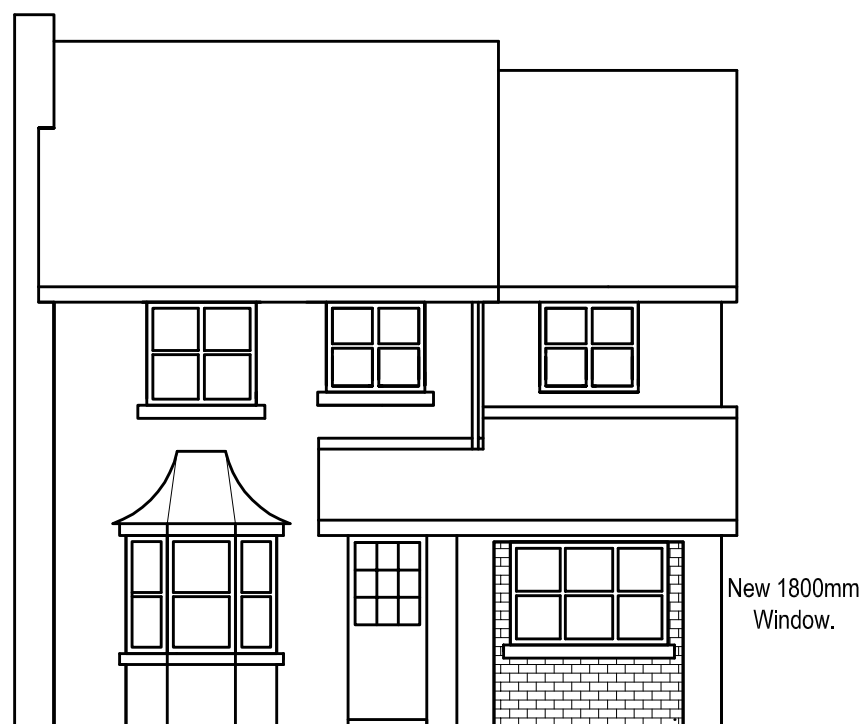
FRONT ELEVATION AS PROPOSED (1:100)