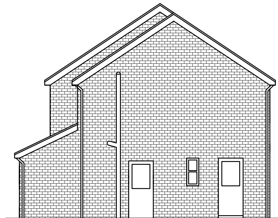
SIDE ELEVATION AS EXISTING (1:100)