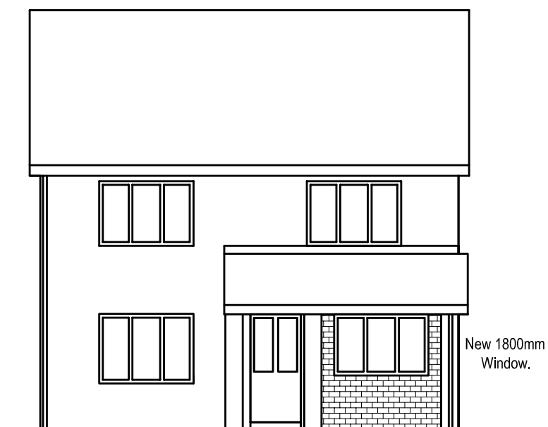
FRONT ELEVATION AS PROPOSED (1:100)