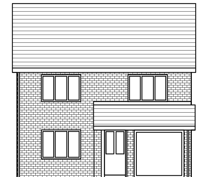
FRONT ELEVATION AS EXISTING (1:100)