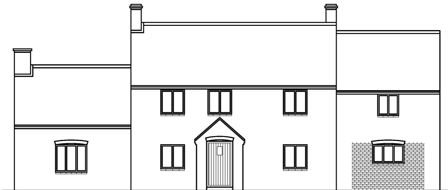
FRONT ELEVATION AS PROPOSED (1:100)