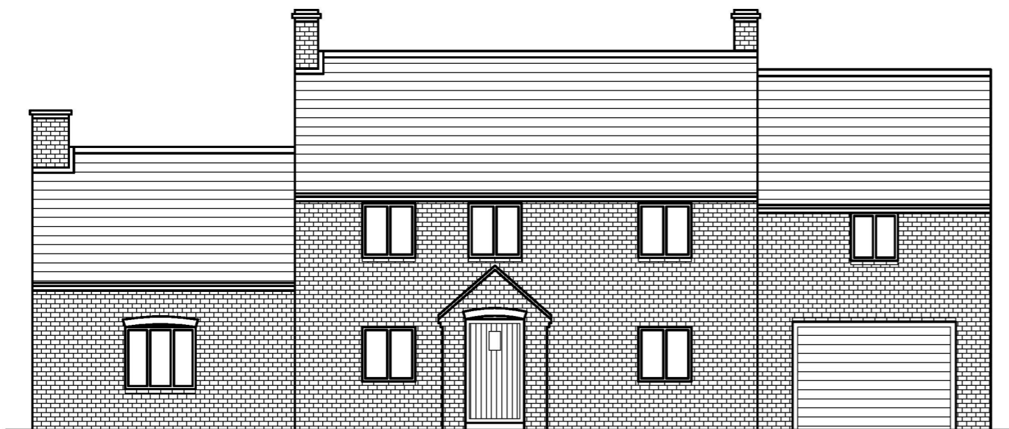
FRONT ELEVATION AS EXISTING (1:100)