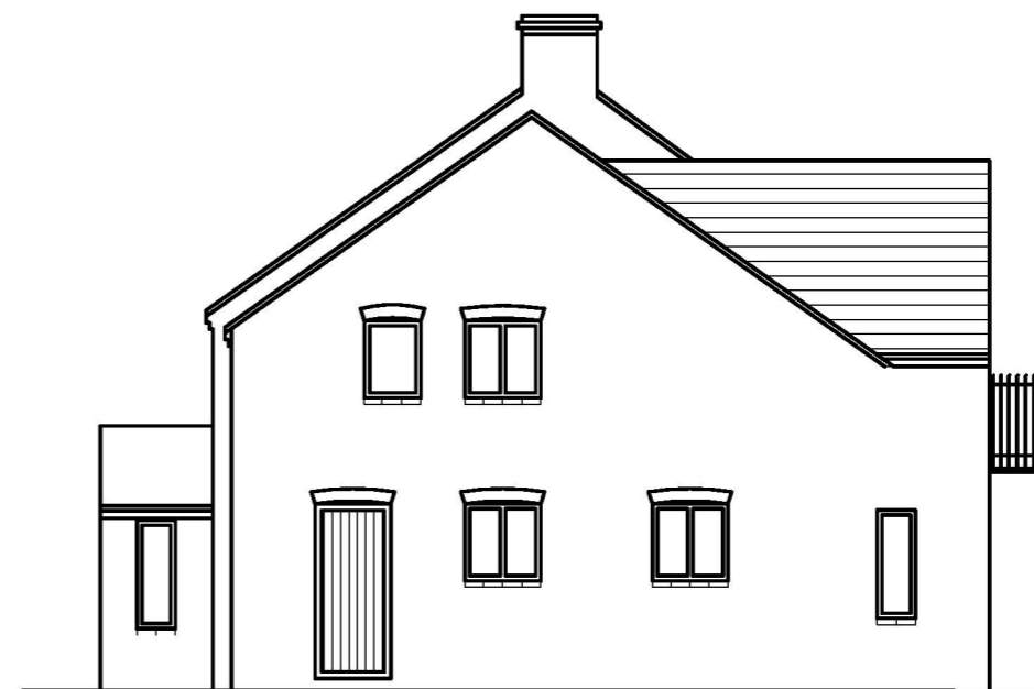
SIDE ELEVATION AS PROPOSED (1:100)